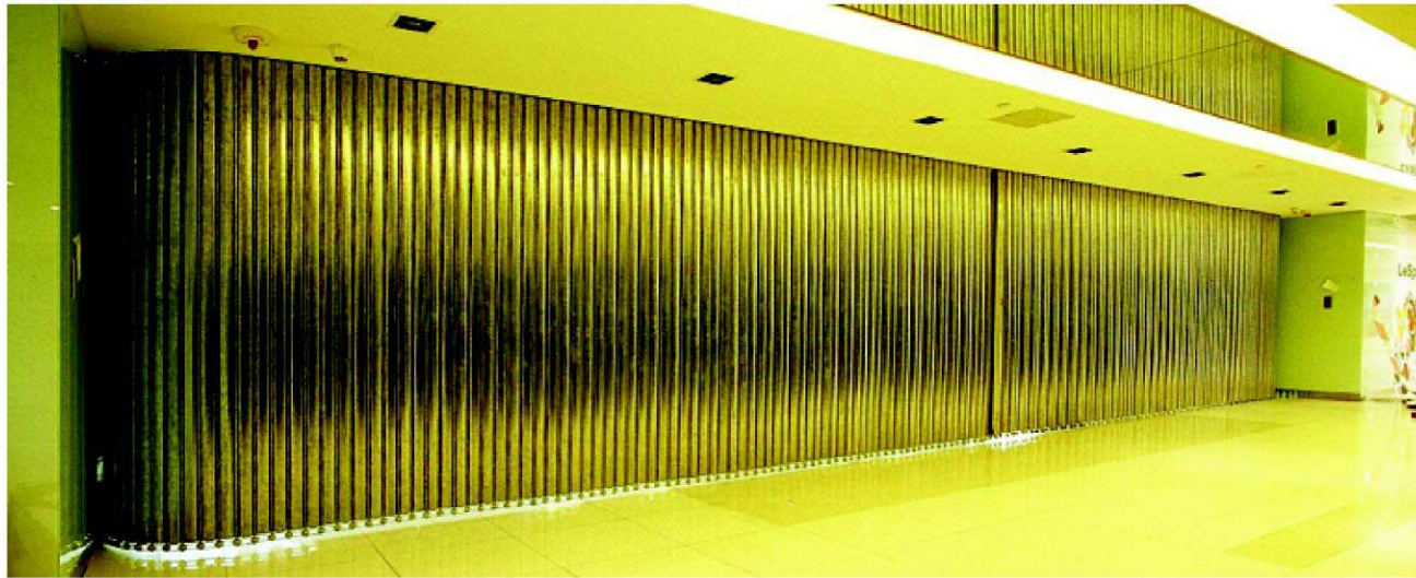
Technology of laterally sliding roller shutter can solve the problem of limited headroom.