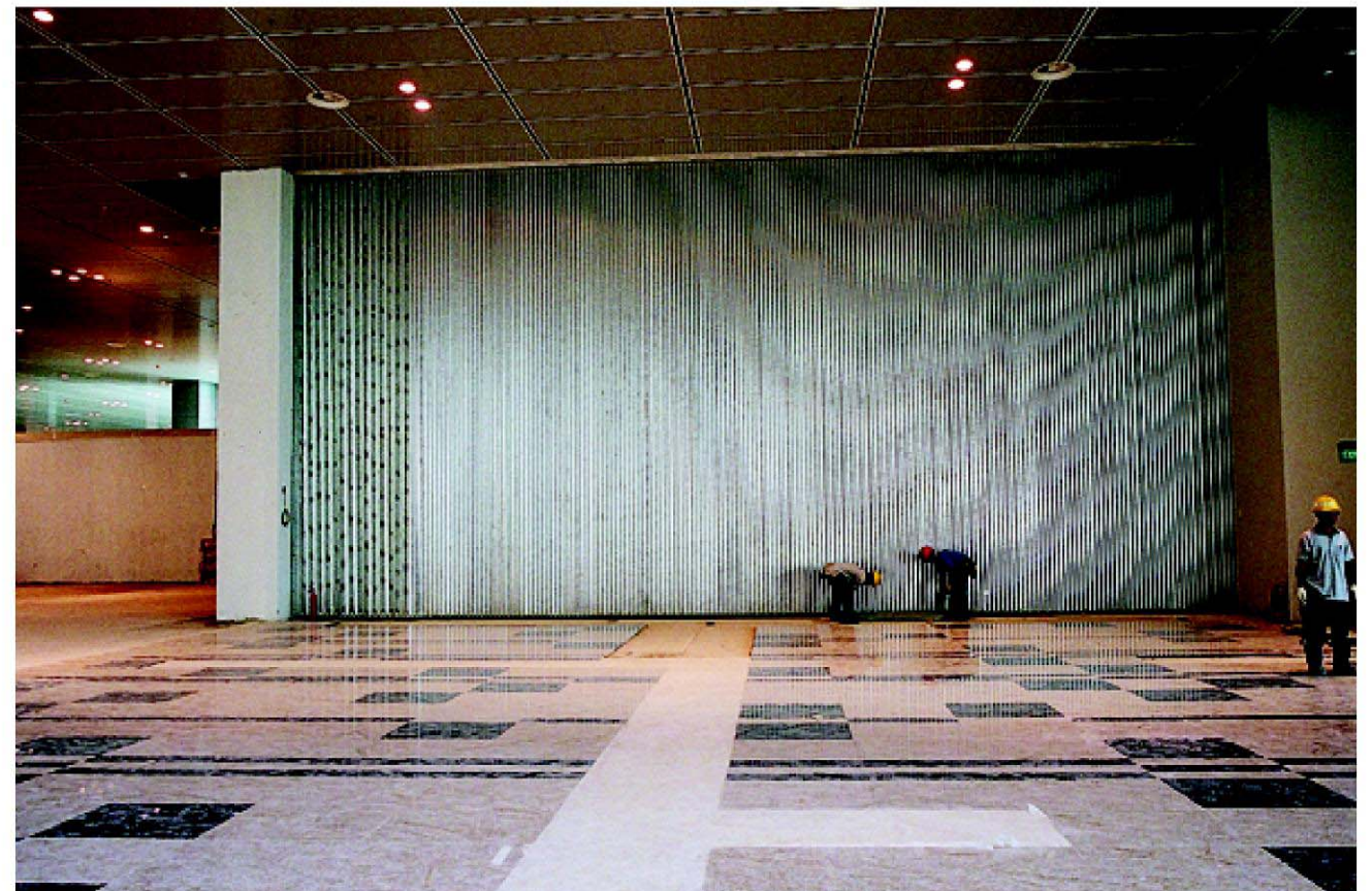
15000mm (W) x 8000mm (H) Fire Rated Laterally Sliding shutter in Singapore Airport